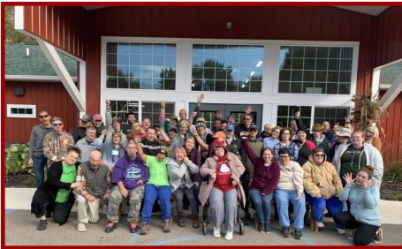
The SHALOM Woolery gang on a typical day.

As a result, the SHALOM Board of Directors has decided to expand the SHALOM Woolery Barn! We plan to add 4,200 square feet to increase office space, areas for new activities, work-space, storage, and elbow room.