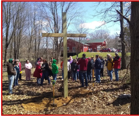
Above, SHALOM Participants gather for devotions at the new cross near the SHALOM Woolery Barn. Below, Participants with a service team from Westwood CRC after landscaping, demolition and sheep shelter projects.